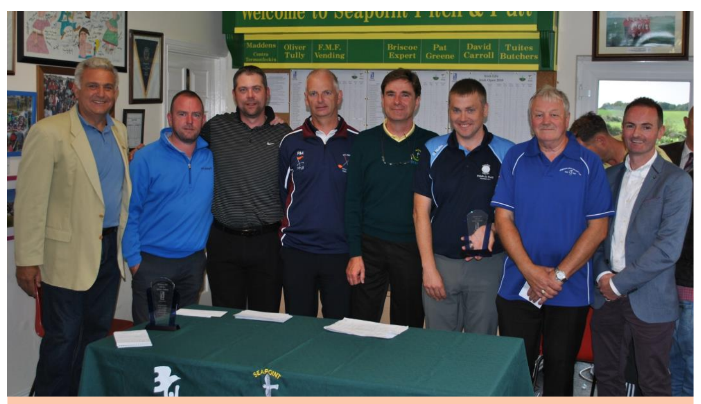
2018 Irish Open @ Seapoint

The former soccer player who was inspired to take up the game by his two sons own feats certainly went a fair share of the way to holding his own in any discussion about Pitch & Putt successes at home!